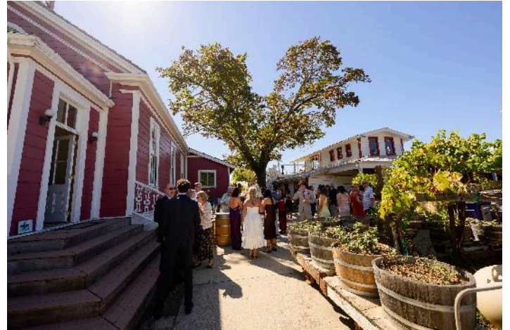
Fig and Olive Tree Patio: Suggested use, Outdoor Dining.